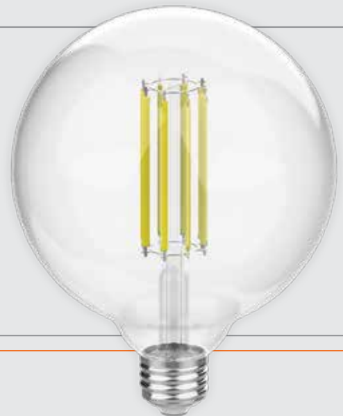
G40 Filament VO-FG40W9-26